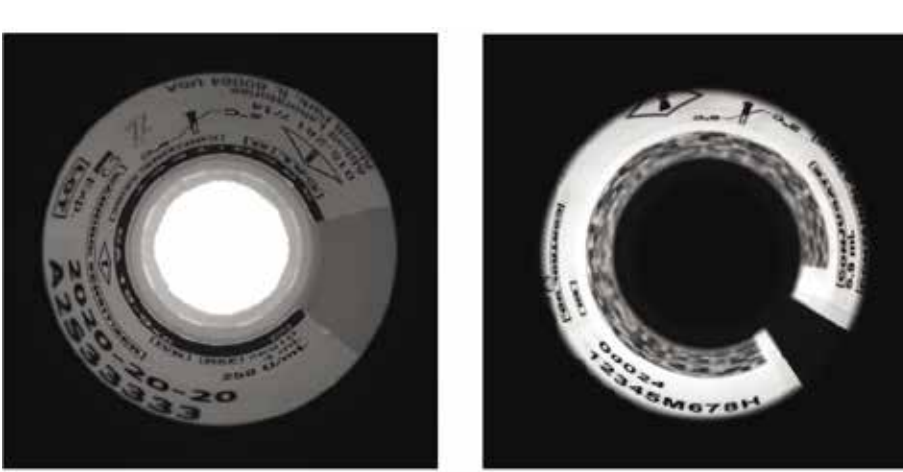
Verifying a label wrapped around a vial captured with one of Opto Engineering's 360° lenses

→ lenses, with a field of view of 7.5 to 55mm and from 5 to 20mm in height, in combination with an Opto ring light. Panagia said that Xyntek sent vials of different sizes, tall bottles around 75mm and smaller vials 40mm tall. For the shorter bottles, the lens setup could capture a single image of the entire sample by maximising the depth of field and imaging at an exposure time of 8ms. The lens, however, couldn't capture the entire label in one shot on the larger bottles, so Opto suggested imaging from the top and bottom.